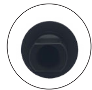
5/8 -11 Thread