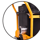
175 CFM Dust Port