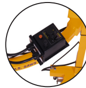
Variable Speed Control Box (Optional)