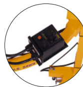
VARIABLE SPEED CONTROL BOX