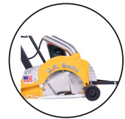
Aluminum Alloy Chassis