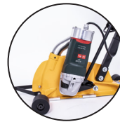
Equipped with Metabo