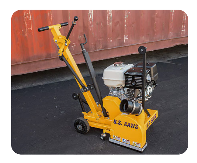
HONDA GAS ENGINE