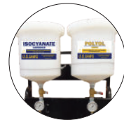
6.5 GALLON TANKS