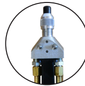
Re-buildable Dispensing Manifold