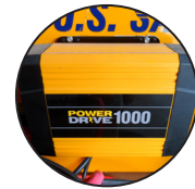
Optional Power Inverter