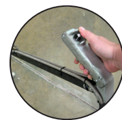
Ergonomic Handle with Start/Stop Switch