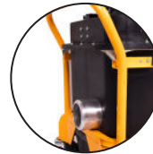
175 CFM Dust Port

U.S.SAWS Ultra-Vac 950 is a powerful and compact dust collection system. The industrial vacuum is a lightweight, durable, sturdy, and job site ready system. The compact size makes it perfect for use on a swing stage and jobs that require going up and down the stairs. This dust collection vacuum contains a single, 120V high-efficiency turbine motor, 9.5-gallon dust bin, 25' 2" hose, and one HEPA filter for maximum dust collection. This system is OSHA certified following table 1 regulations.