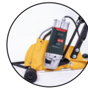
Equipped with Metabo