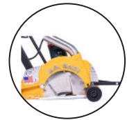
Aluminum Alloy Chassis