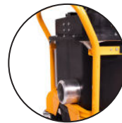
175 CFM Dust Port