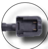
Battery Adapter Plate