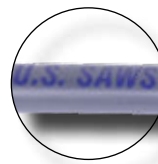
Durable PVC/Plastic Construction