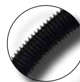
Flexible Discharge Hose