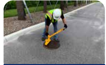
4. Replace & Release