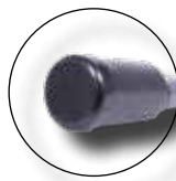
Built in Screen to Block Debris