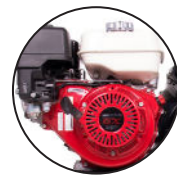
Honda Gas Engine